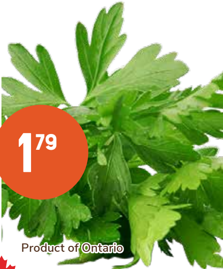
Product of Ontario