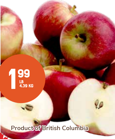
Product of British Columbia