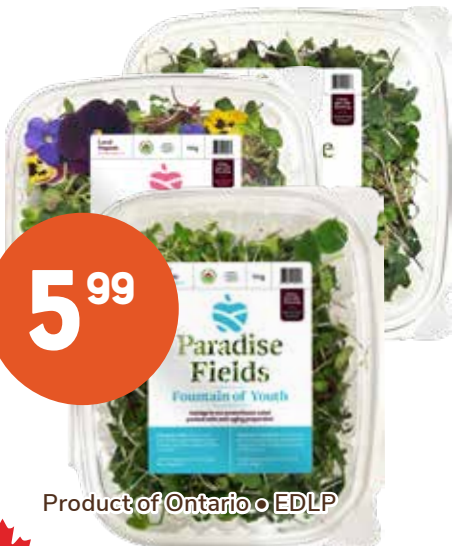
Product of Ontario o EDLP