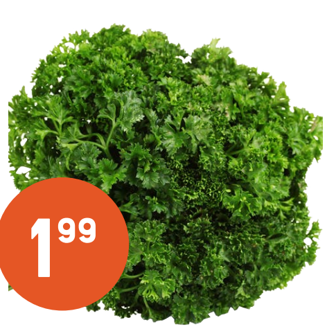
Product of Ontario