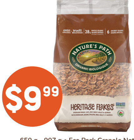
650 g - 907 g • Eco Pack Granola Not