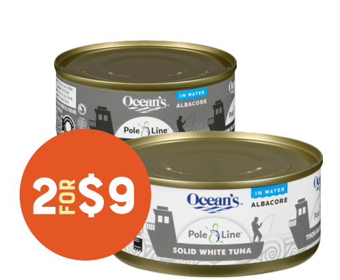
170 g • Solid or Flaked